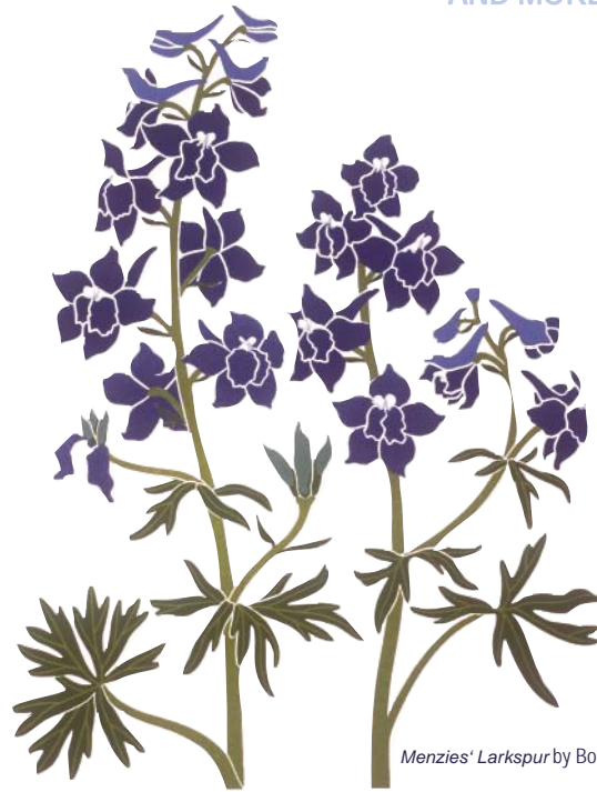
Menzies' Larkspur